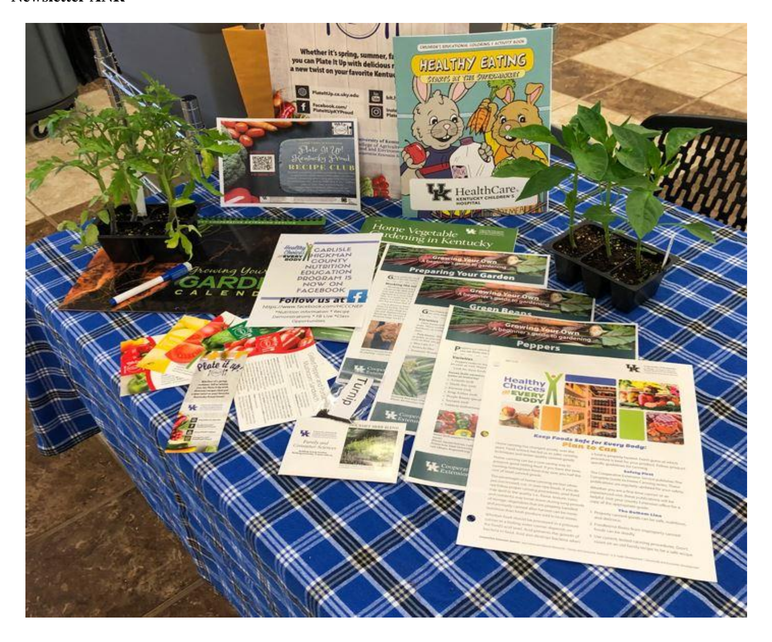
Garden Give Away-April 14 at the Carlisle County Extension Office-pictured